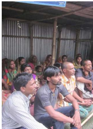
Cell church meeting in makeshift hut