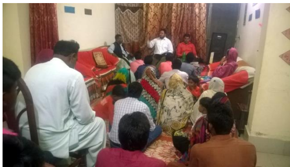
House fellowship meeting