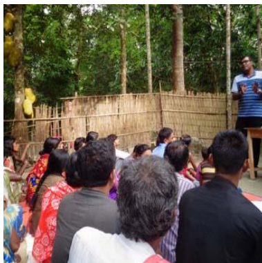
Open air training