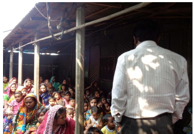
Pastor sharing in a makeshift hut in Savar