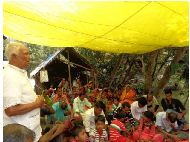
Sharing in a house church

I have undergone GFA training. It has truly been a blessing for me and my Cell members. Our Lord Jesus Christ has been so gracious to us, blessing us and meeting all our needs. In February 2016, I was diagnosed with Pre-Diabetes and Hyperthyroid where my thyroid levels were extremely high. I am just 38 years old and I was really depressed. I kept praying everyday and after the training, I was prayed for. After that the doctor told me that my thyroid levels, my blood sugar and blood haemoglobin levels are perfectly normal. I thank God for having performed this great miracle!