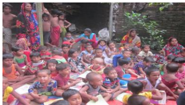
Children studying in open-air area