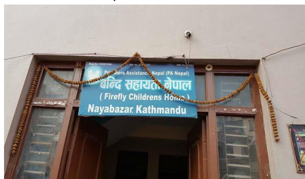
Visit to Firefly Children's Home