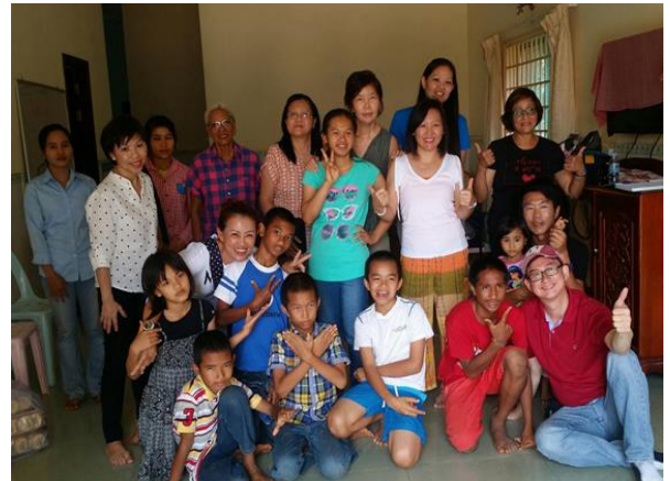
Jan 2016 The committee members of the Board governing MIKI Home.