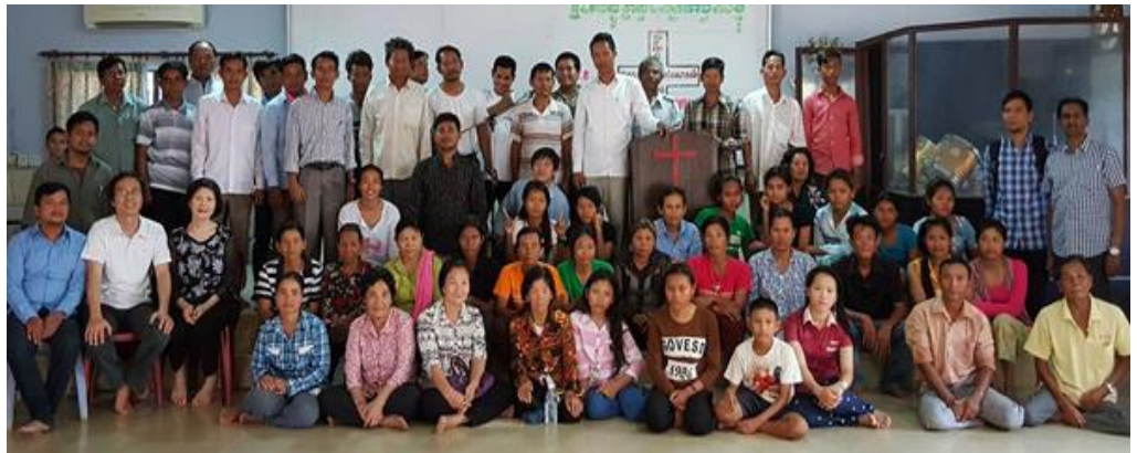
Leaders attending the training