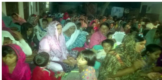
Adults including children attended the night rally.