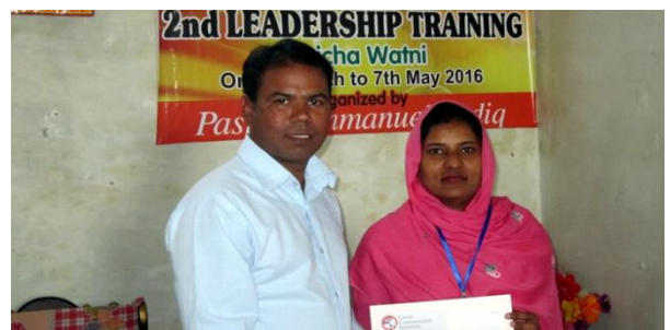
Leader receiving certificate