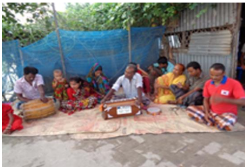
Worship in a house church

GFA Training has helped me to walk afresh with my Lord. I enjoyed all the lessons. I am stunned by the youths who have dedicated themselves to serving the Lord. I love the lessons with all my heart and soul as it is making me draw closer to the Lord.