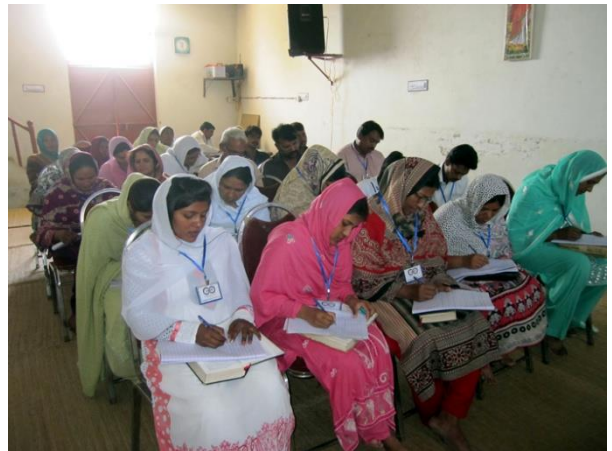
Leadership Training: 33 participants