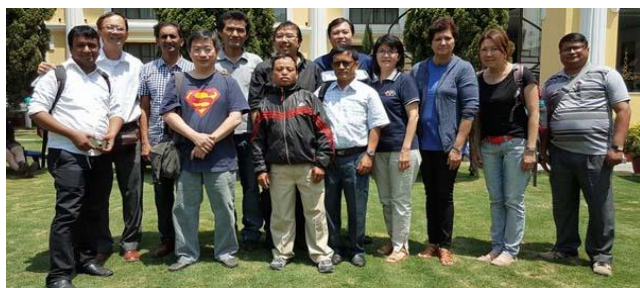
NLCC team members with Nepali leaders

This trip has been fruitful in cementing partnerships and discussions for future planning in areas of children ministry training, community development and church planting.