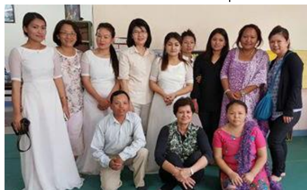
NLCC Children Ministry teachers with the Nepali Children Ministry teachers