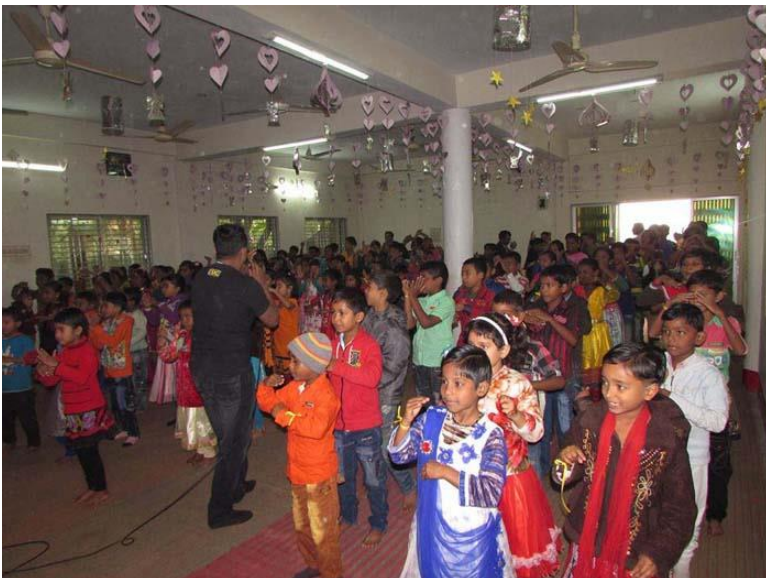
Children in colourful dresses in a Children Ministry class

I am also thankful to all of my GFA pastors and leaders for your kind prayers and also request that you keep me in your prayers that I will depend always on the Lord.