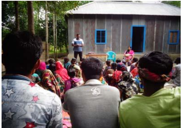
Revival meeting in progress