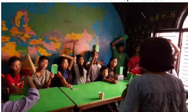
Teaching the children