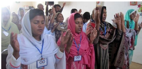
Participants in deep worship

Formation of Cell Group at Village 173 : We started one Cell Group in Village 173.