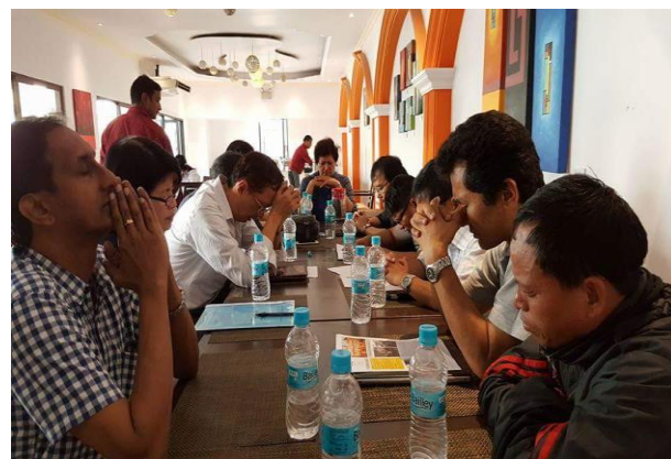
Praying fervently before delivering the Word of God