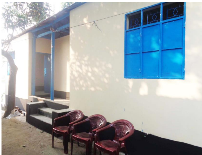
Sarvar School/Church, Dhaka

We thank God for donors who channeled in funds to complete the School-cum-Church in Sarvar, Dhaka, Bangladesh. This premises will benefit 200 kids and will also be used for community project training. The objectives are: 1) To provide basic education for disadvantaged children. 2) To create employment opportunities for qualified teachers and vocational instructors. 3) To provide space for Worship Services, Sunday School and weekly Bible Study.