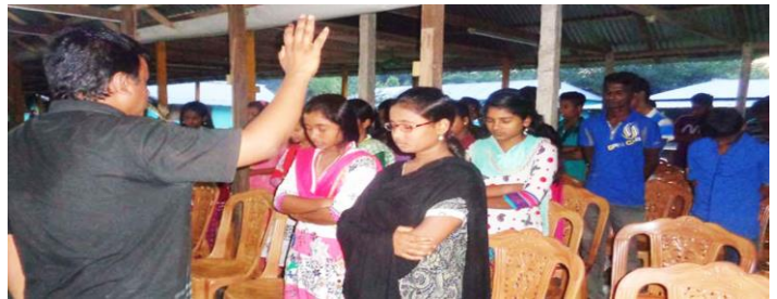
Prayer for the next generation