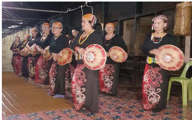
Traditional dances to welcome team