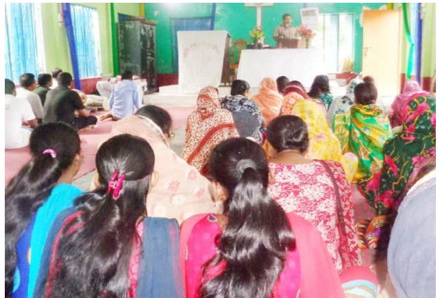
Leadership training in progress

Home Visitation: We visited 23 families. During the visits, we shared the Word of God, heard their prayer requests and prayed for them.