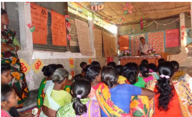
Ministering to the ladies

We visited 17 families in Sri Mongol. It is a beautiful district in Bangladesh. There are acres and acres of tea plantations and rubber trees. Many people are working in the tea plantations. Sri Mongol is a hilly place and the roads are very narrow. Some areas have no transport, so we need to walk for 5 or 6 kilometers to reach a certain destination. The residents are living under deep poverty. Some have only one meal a day but they have a strong desire for the Lord.