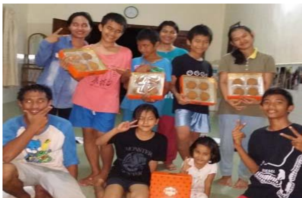
Yummy mooncakes from Singapore