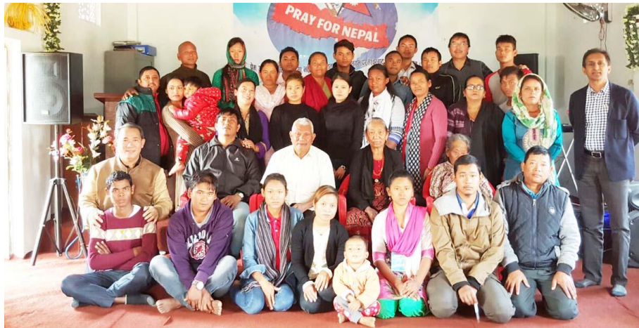
Pastors and leaders with their families