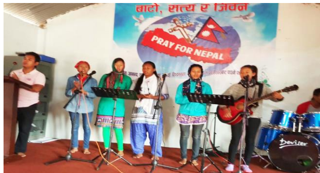
A time of worship before the training sessions