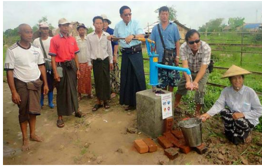
Trying out the water tap

GFA continue digging more wells with hand pumps as a urgent request came in. Due to a drought in May-June in 2016, many had to walk miles to get water or drink contaminated water from existing water sources like pond. To date, we have completed 29 wells in needy villages. The people are very grateful since they can have access to clean water.