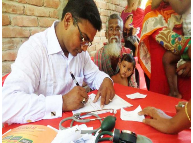
A doctor giving a child's prescription

A few months ago, many villages were devastated by floods. Many people were afflicted with diseases but they did not have enough money to buy medicines. The people were afflicted with skin disease, fever, diabetes, stomachaches, Hepatitis A, B and C. Our doctors and volunteers treated them and many were happy and blessed to receive the treatment. We also conducted blood tests for certain patients, especially those over 40s and serious cases. Our pastors and leaders will continue to visit them and help them with counseling and prayers.