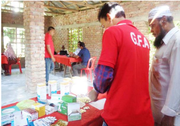
A GFA volunteer helping to sort out the various medicine

We conducted a medical camp in Jessore District. The objectives were to provide medicine, vitamins and antibiotics to the villagers. We also helped to increase awareness of basic hygiene and preventive health care and to determine the percentage of the most common diseases among them. The team comprised of 3 doctors, 1 dentist, 3 para medical staff and 6 volunteer workers.