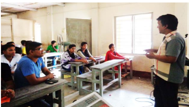
Ps Newton was teaching the youths

We are very happy to have the opportunity to learn more of God's Word through GFA training in our village.