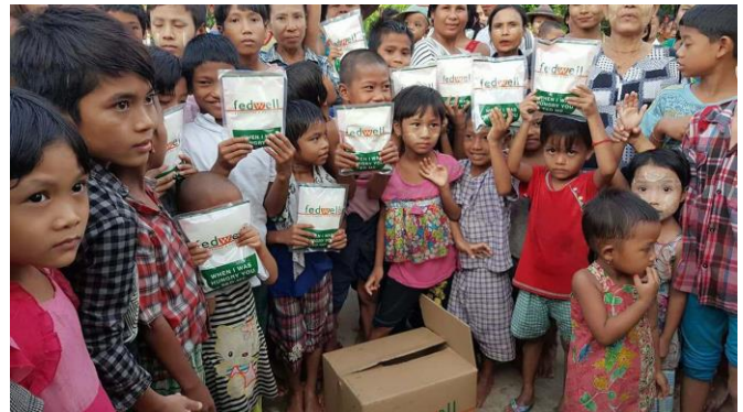
Kids received dry food packs