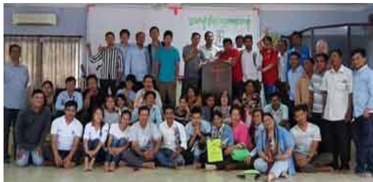
Leadership training group picture