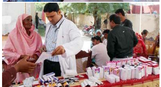
TOP: A child was being treated