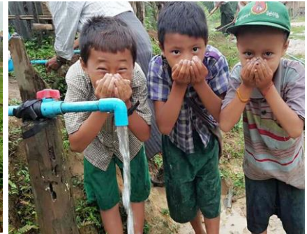
3 children drinking the water