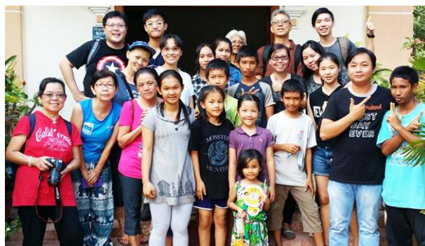
Singapore team with the children.