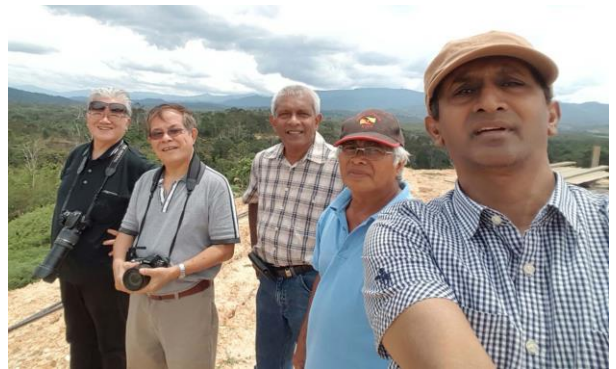
Visiting the Bario hills