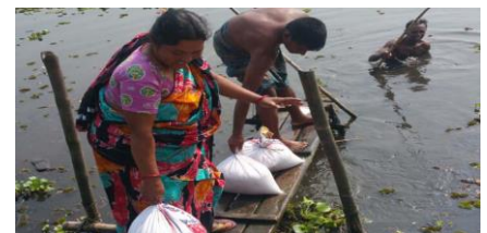
Some rice sacks fell into water. Later they were hooked up and dried.

partnered GFA in the reconstruction of some houses and church buildings, in dire need of repairs after the flood waters receded. Christian love in practical action.