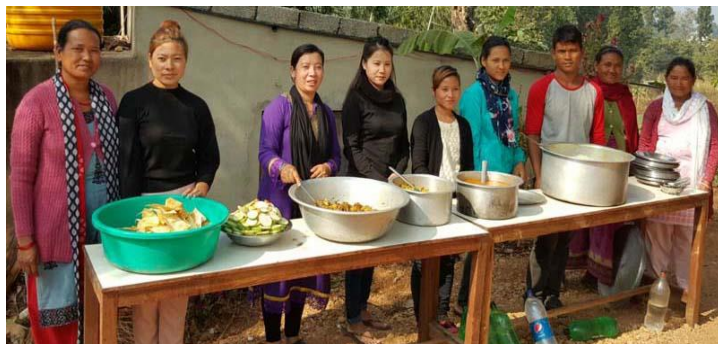
Physical food for 40 people