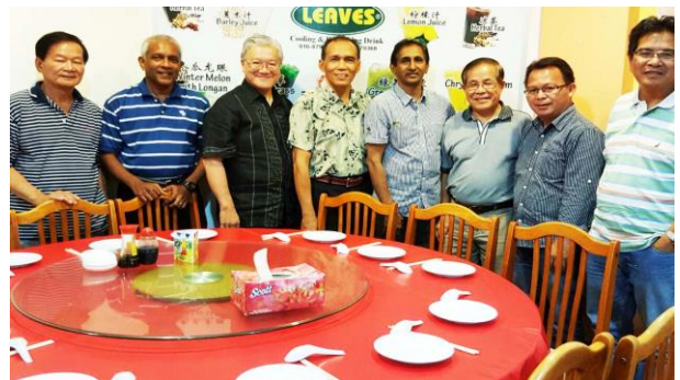
Dinner fellowship at Canada Hill, Miri