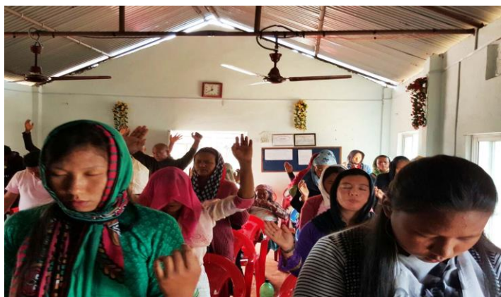
Worshipping the Lord