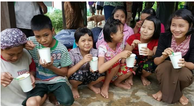
Children eating porridges from their cups

The continued heavy rain across parts of Myanmar since July 2016 caused heavy flooding that affected about half a million people. As many as 100,000 people had to be evacuated. GFA sent in some funds so our partners were able to respond immediately to rescue some people affected by the floods. Food, water and relief items were purchased and distributed to the victims. At times, food was cooked for the display until they could return home.