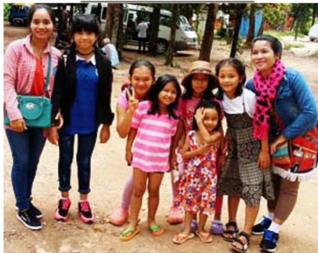
Enjoying an outing.