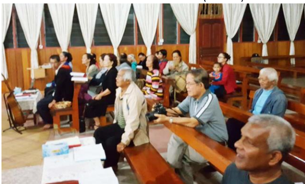
Church Service at Bario Church