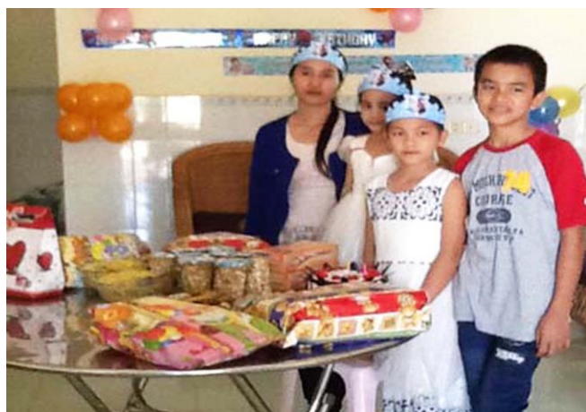
Birthday celebration with friends