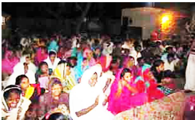
A big crowd at the Night Rally

I am a young Christian of 22 years. I am thankful to the pastors who came to our city. God did great work in our lives and after the training program, the villagers in my vicinity were experiencing spiritual revival. After the first training session, I was filled with the Holy Spirit and I prayed to God that I wanted to work among the youths. He answered my prayer and used me for the youths. We started a Youth Group in the House Church and we have fellowship every Wednesday. Praise the God, we have 13 members in our Youth Fellowship.